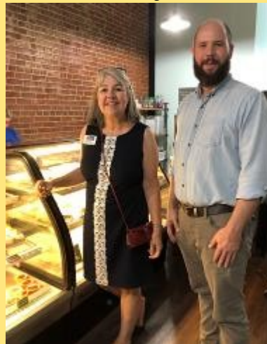
We even got a tour of the new brewery and bakery!