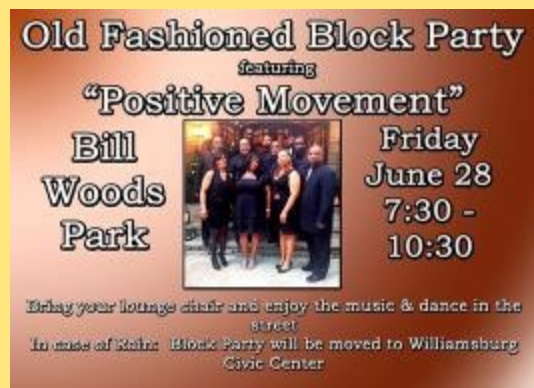
Williamsburg will be rocking this Friday!